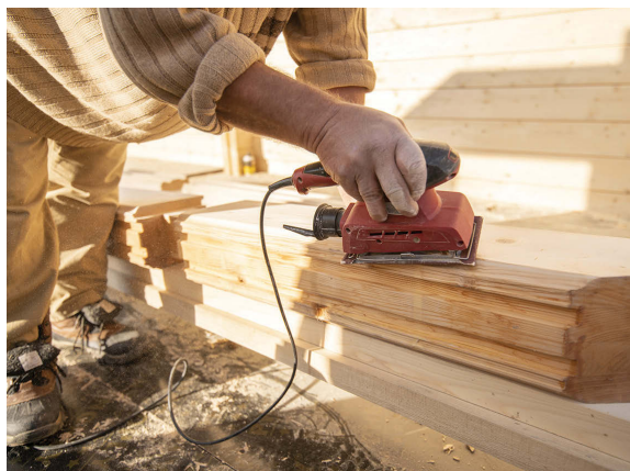
The following are some potential home improvement presents for DIY enthusiasts.

A recent survey by the remodeling company Allstar Home reported that 70 percent of Americans have recently engaged in DIY home improvement projects. Similarly, a new Ipsos poll conducted on behalf of the DIY Network found that 73 percent of Canadian homeowners have done a renovation project themselves in the past. With so many homeowners tackling projects around the home on their own, DIY-related products may be just what's needed to hammer down the perfect gift. The following are some potential