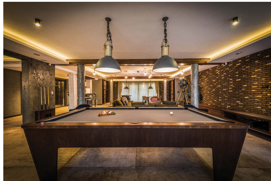
A seldom-used formal dining area can be converted into a game room with a few simple touches.

• Home office: The COVID-19 pandemic changed the way many modern workers go about their typical workday. Millions of workers now work from home at least a few days a week if not full-time. When the pandemic began, that led to a space crunch, particularly in homes with more than one working adult. Workers who have been using the formal dining table as a desk for years can now fully commit to repurposing the room.