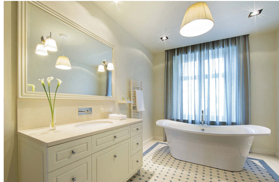
When it comes to bathrooms, homeowners can keep an eye out for various signs suggesting the room needs a remodel.

• Rising water bills: Some signs a bathroom could use a little TLC are not necessarily confined to the room itself. If water bills are rising significantly and do not align with price increases or an uptick in water consump-